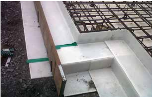
Internal / external corners can be formed on site

OneForm can also be adapted to connect to the DPM.